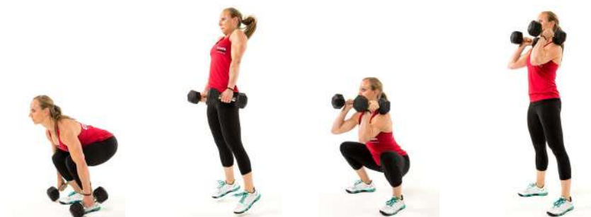
(D) 2-dumbbell squat clean