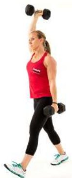
(E) 1 dumbbell overhead, 1 at hang