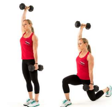
(E) 1 dumbbell overhead, 1 hanging