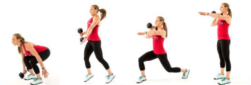
(J) 1-dumbbell split clean

Split cleans can also be performed from the ground or the hang with one or two dumbbells.