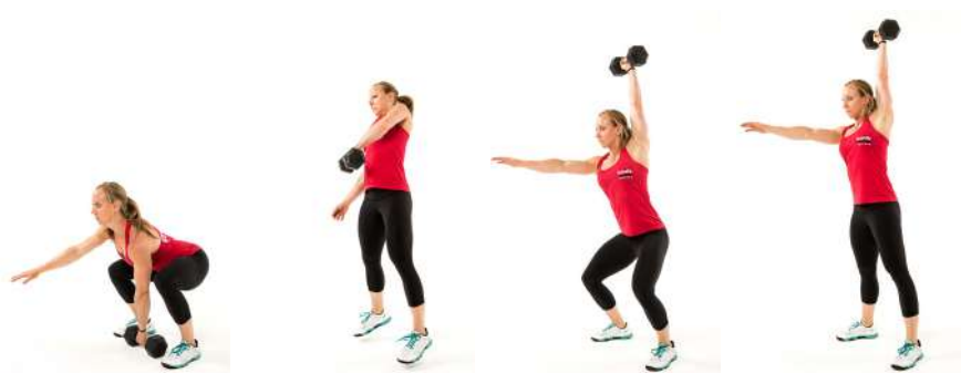
(A) 1-dumbbell power snatch

Snatches can be taken from the ground or the hang and received in the power position or the squat position. All variations can be performed with one or two dumbbells. The full squat snatch with two dumbbells is VERY challenging! You can experiment by starting with the dumbbell or dumbbells outside the legs ( I ), but typically it is most comfortable to start a snatch variation with the equipment inside the legs.