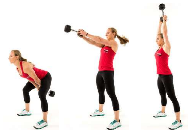
(B) Both hands grip head of dumbbell