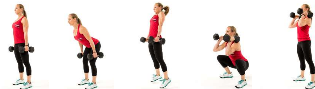
(H) 2-dumbbell hang squat clean