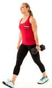
(A) 1-dumbbell farmers carry

Carries can be performed with one or two dumbbells at the hang (A—farmers carry), the rack position (B), overhead (C) or in a combination (D, E, F).