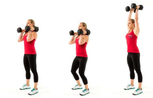
(B) 2-dumbbell push press