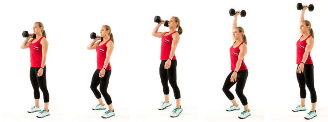
(A) 1-dumbbell push jerk

Dumbbell push and split jerks can be performed with one ( A, C ) or two dumbbells ( B, D ).