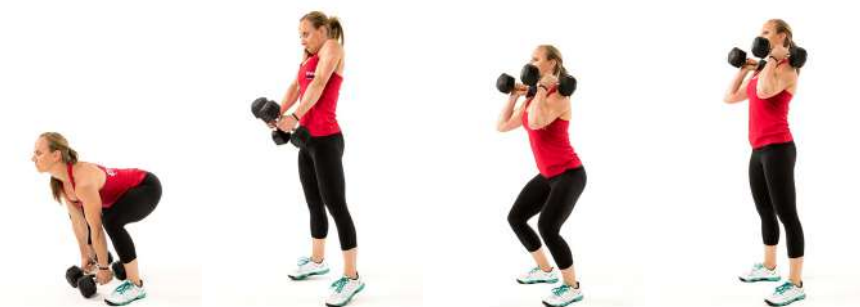
(I) 2-dumbbell power clean from inside the legs

Split cleans can also be performed from the ground or the hang with one or two dumbbells.