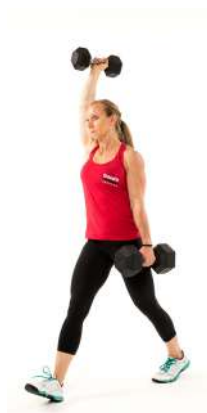
(G) 1 light dumbbell at rack, 1 heavy dumbbell at hang

Another option: Experiment with a heavier dumbbell in one position (G) . Typically, you will place the heavier dumbbell in the easier position and the lighter dumbbell in the more challenging position.