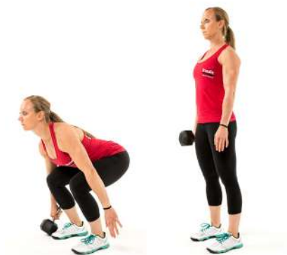
(A) 1 dumbbell outside the legs

The dumbbell deadlift can be performed outside the legs, “suitcase style,” with one (A) or two (B) dumbbells, or inside the legs with a single dumbbell (C)