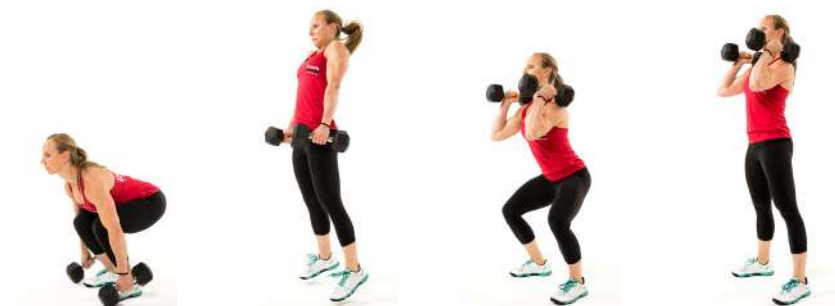
(B) 2-dumbbell power clean