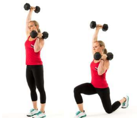
(D) 1 dumbbell overhead, 1 racked