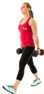
(A) 2-dumbbells farmers carry