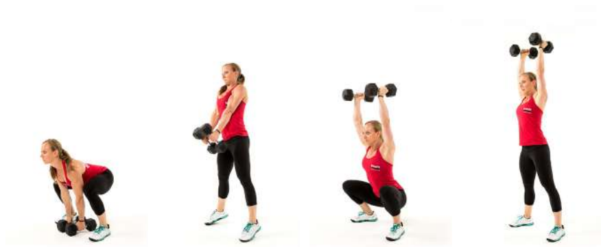
(D) 2-dumbbell squat snatch