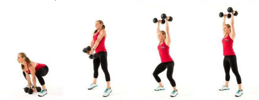
(B) 2-dumbbell power snatch