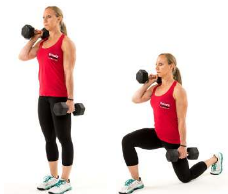
(F) 1 dumbbell racked, 1 hanging

Another option: Experiment with a heavier dumbbell in one position. Typically, you will place the heavier dumbbell in the easier position and the lighter dumbbell in the more challenging position.