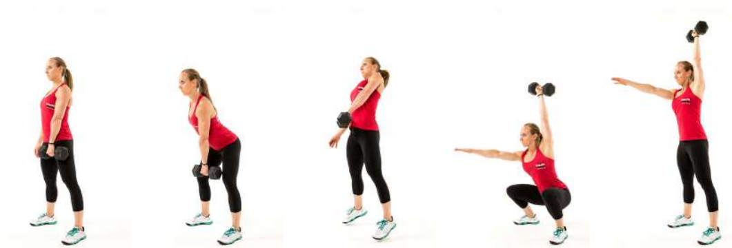
(G) 1-dumbbell hang squat snatch