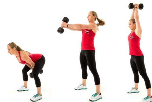
(A) Both hands grip middle

Swings can be performed by gripping the middle of the dumbbell with both hands (A) or the head of one dumbbell with both hands (B) . Make sure your equipment is in good condition if you choose the second option.