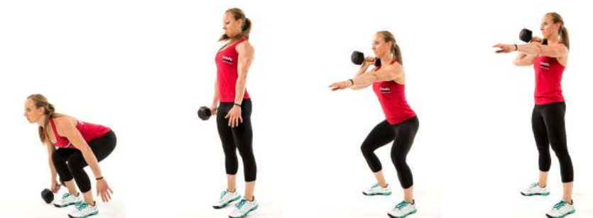
(A) 1-dumbbell power clean

Cleans can be taken from the ground or the hang and received in the power position or the squat position. All variations can be performed with one or two dumbbells. You can experiment by starting in a wide stance with the dumbbell or dumbbells inside the legs (1) , but typically it is most comfortable to start a clean variation with the equipment outside the legs.