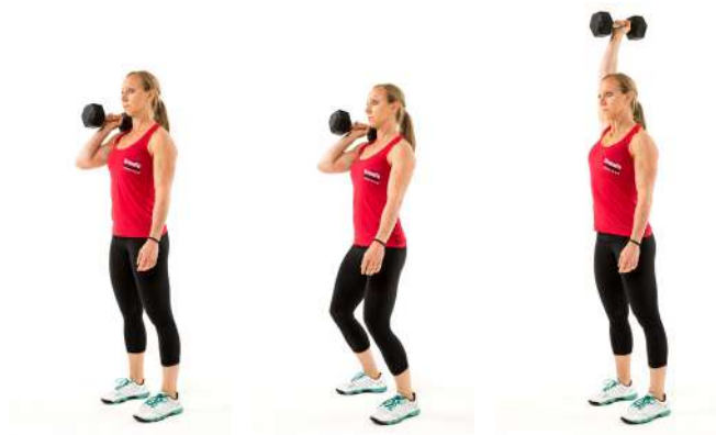
(A) 1-dumbbell push press

Dumbbell push presses can be performed with one (A) or two dumbbells (B) . Another option: Alternate push-pressing one dumbbell while holding the other at the rack or overhead (C)