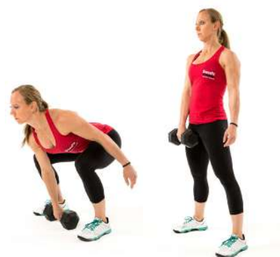
(C) 1 dumbbell inside the legs (requires less stability than the 1-arm suitcase style)