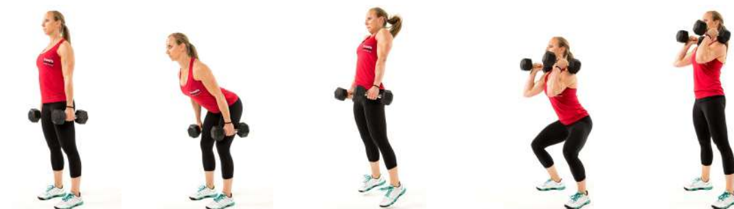
(F) 2-dumbbell hang power clean