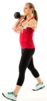
(B) 1 dumbbell at rack