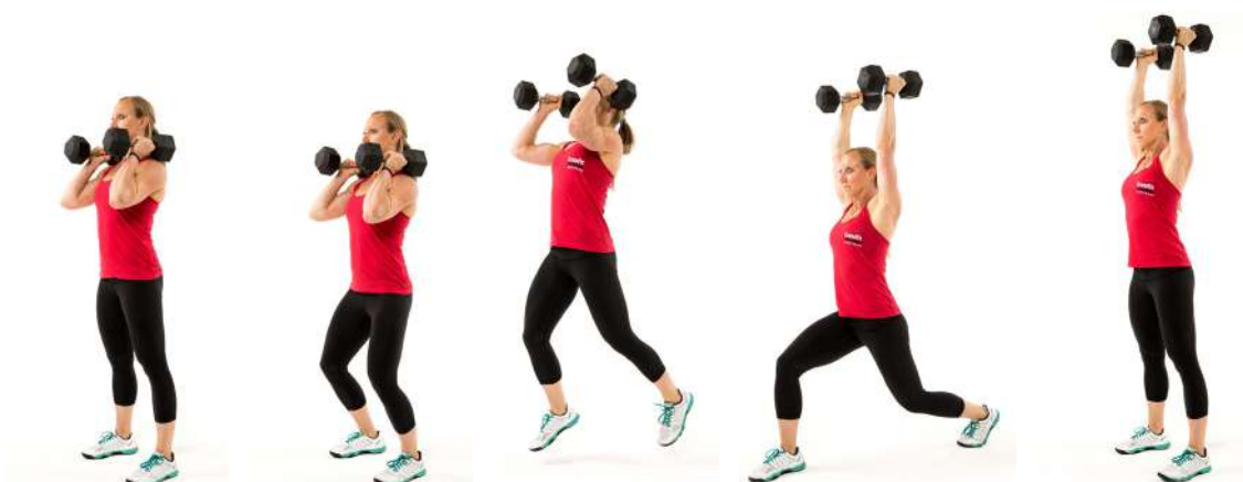
(D) 2-dumbbell split jerk