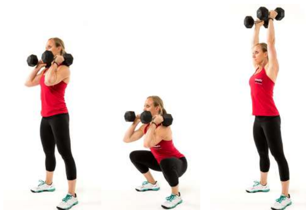
(B) 2-dumbbell thruster