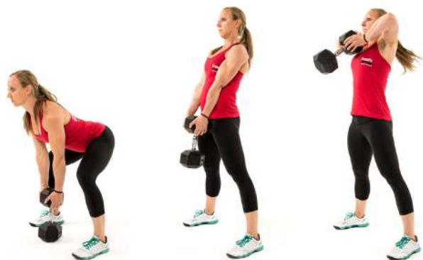
(A) Dumbbell sumo deadlift high pull

The dumbbell sumo-deadlift high pull can be performed with one dumbbell using both (A) or only one arm (B) . The single-arm version may also be referred to as a clean pull.