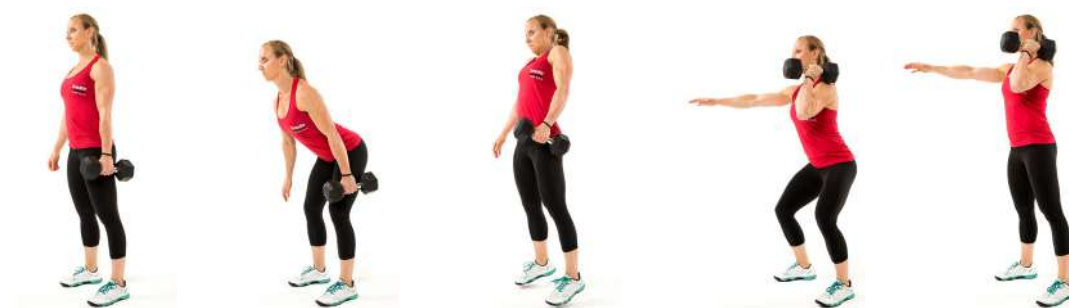
(E) 1-dumbbell hang power clean