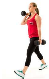
(F) 1 dumbbell at rack, 1 at hang

Another option: Experiment with a heavier dumbbell in one position (G) . Typically, you will place the heavier dumbbell in the easier position and the lighter dumbbell in the more challenging position.