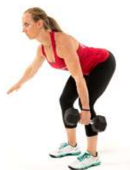
(A) 1-arm dumbbell row

Rows can be performed with one (A) or two dumbbells (B) . Another option: Alternate rowing one dumbbell while holding the other at the hang (C) or at the chest (D) .