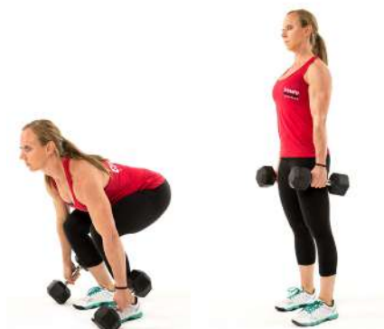
(B) 2 dumbbells outside the legs