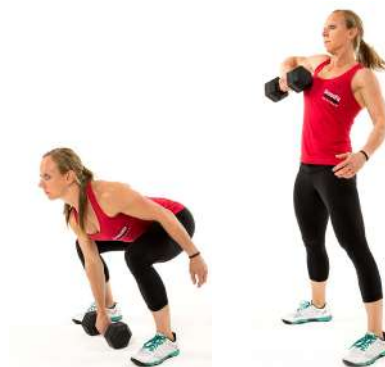
(B) Single-arm sumo deadlift high pull