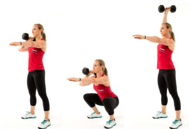
(A) 1-dumbbell thruster

Dumbbell thrusters can be performed with one (A) or two dumbbells (B) . Another option: Alternate pressing one dumbbell overhead while holding the other at the rack (C)