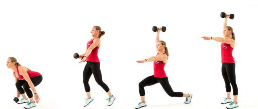
(I) 1-dumbbell split snatch

Split snatches can also be performed from the ground or the hang with one or two dumbbells. Experiment with starting from inside and outside the legs during split-snatch variations.