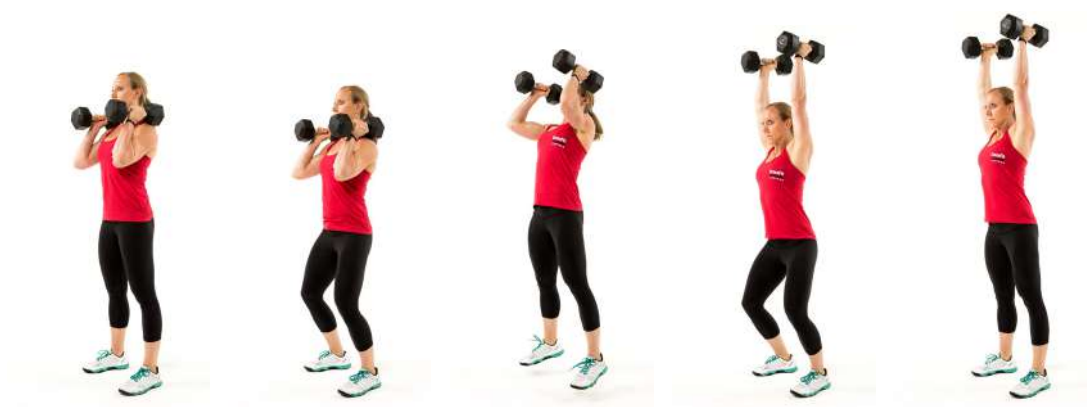
(B) 2-dumbbell push jerk