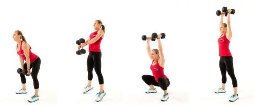
(H) 2-dumbbell hang squat snatch (this variation is usually performed with the dumbbells inside the legs)

Split snatches can also be performed from the ground or the hang with one or two dumbbells. Experiment with starting from inside and outside the legs during split-snatch variations.