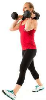
(B) 2 dumbbells at rack