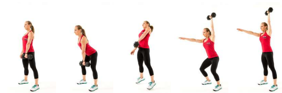
(E) 1-dumbbell hang power snatch