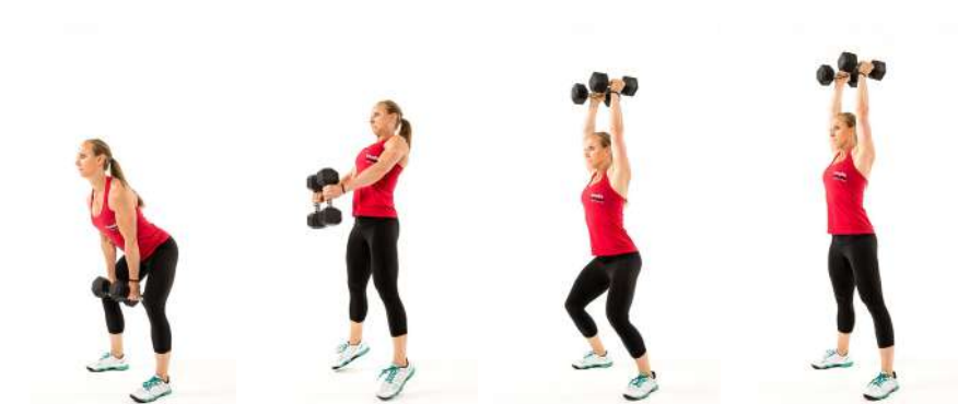
(F) 2-dumbbell hang power snatch (this variation is usually performed with the dumbbells inside the legs)